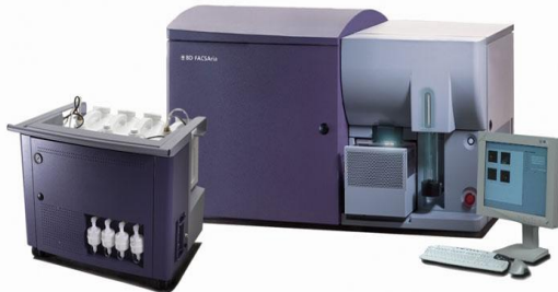
BD FACSria & BD FACSria II