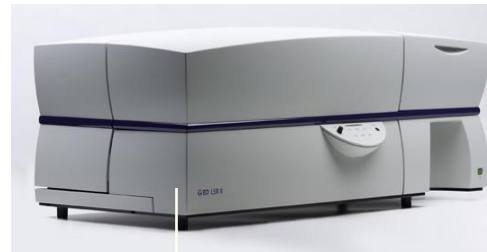
BD LSR II